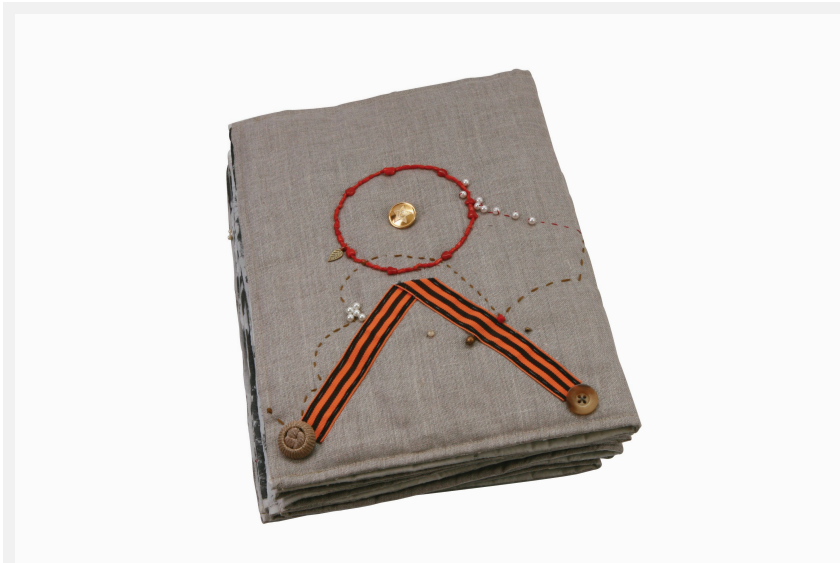
"Book of Buttons" | Text handwritten and embroidered in English and Spanish by the author. Silk and linen, embroidered by author with beads and buttons of family's collection.

IA: When I studied art in college, I always consulted art books in the college library. Later, at the Russian Academy, learning how to use the college's library was very important for investigation projects, both physically and virtually. Artist's book exhibits are more often displayed at libraries, as well. In the USA, artist's books have their place at the special collections of college libraries, but in Mexico libraries are barely beginning to pay attention to the subject. My books are in libraries in the USA and in Russia.