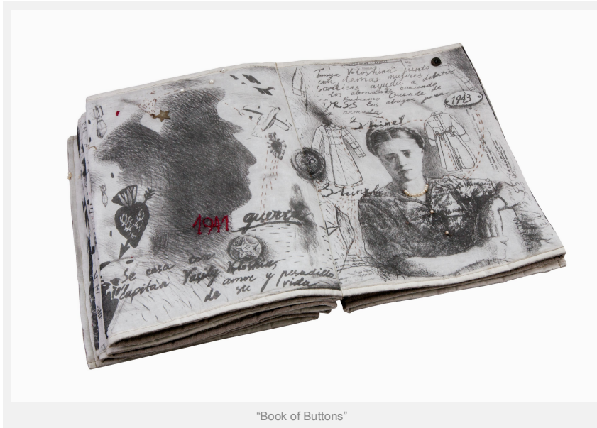
"Book of Buttons"

LAIP: As an artist, what would your ideal library be like? What kinds of stuff would you be able to check out, and what could you do there?