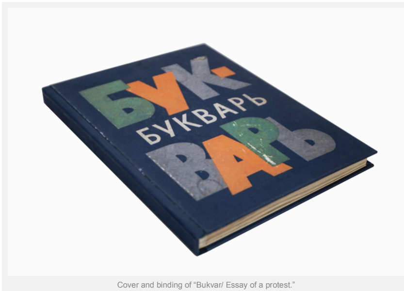
Cover and binding of "Bukvar/ Essay of a protest."

Another project I'm working on includes my students and consists in a portfolio of lino prints in the style of popular engraving. Normally I try to develop several projects at the same time. We've just concluded an exhibition in Russia at a very important museum with the prints and artist's books of our Mexican university.