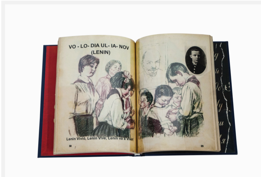
"Bukvar/ Essay of a protest." Laser print from author's first elementary school book (1978, DDR, URSS), historical images printed in laser on mylar plate.

CHECK OUT OUR BOOK FROM COFFEE HOUSE PRESS!